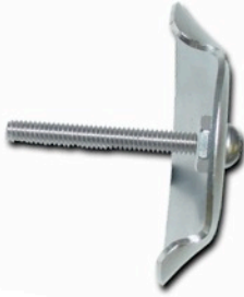
Deflector Plate Opening