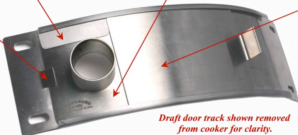
Draft door track shown removed from cooker for clarity.

Note: There is no need to remove the original Mfg. draft door.